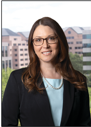
Tiffany Burton Go-To Lawyers Taxation 2025